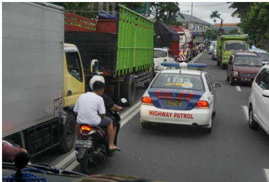
It is much faster if you can use either side of the road – the poor bus drivers were stressed at times!