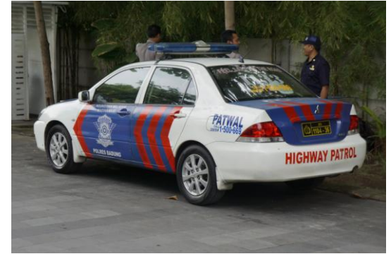
Ibu Indy arranged a police escort for the buses to her place for the evening BBQ