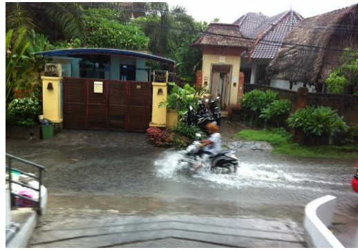
Wednesday was a little damp...